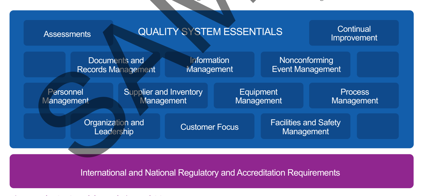
Figure 1. The QMS Model Foundation and QSEs

The QMS model in this guideline was derived by sorting individual requirements from international and national regulations and standards, as well as published accreditation requirements for medical laboratories, into topics, ie, identifying all the requirements for a single subject such as laboratory equipment or personnel. Each topic's requirements were then arranged into sequential order by how they should occur when a new laboratory or new laboratory service is set up. The resulting topics of requirements were recognized as fundamental building blocks of quality and were given the title of QSEs, as shown in Figure 1.