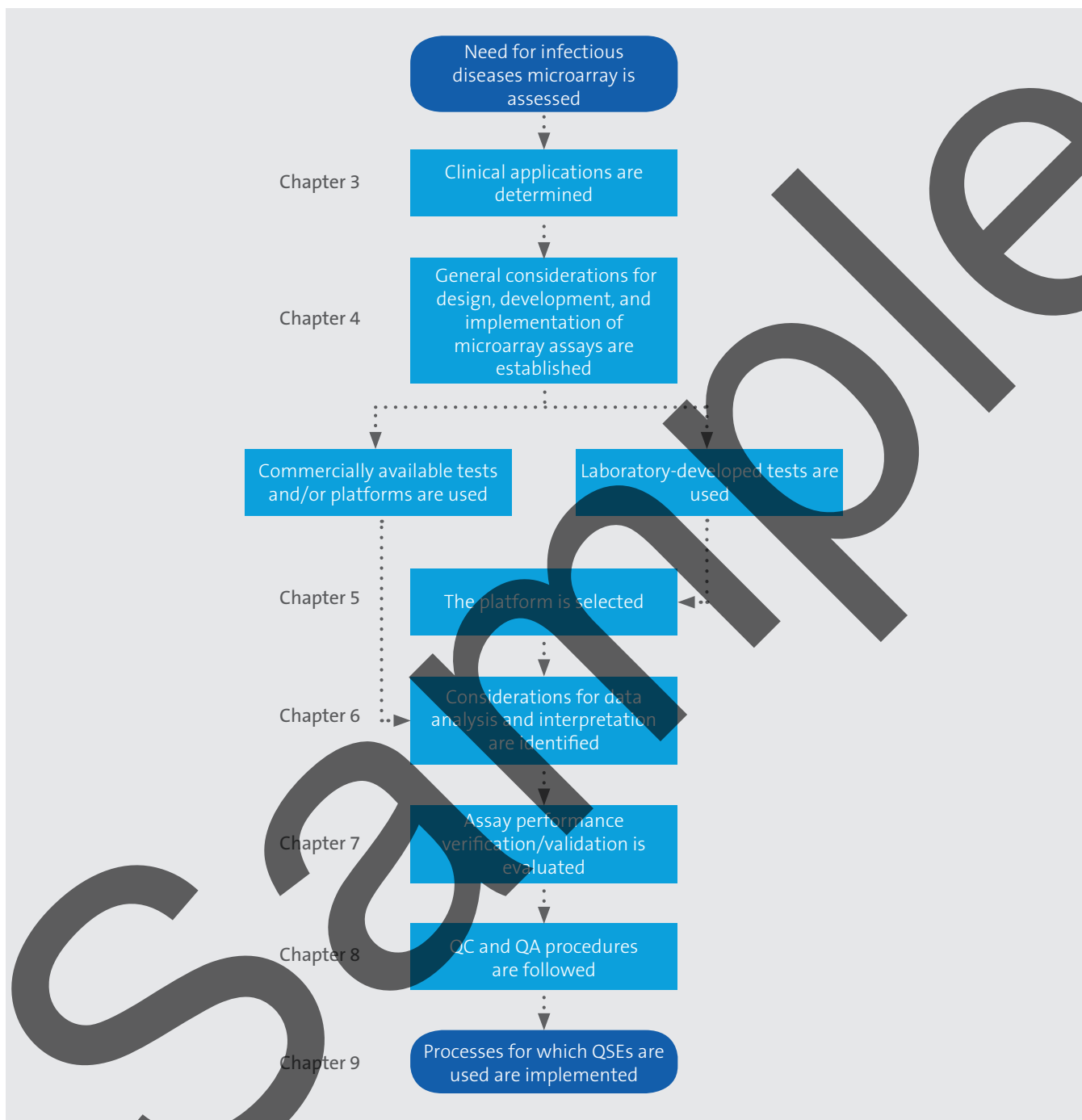
Figure 1 shows the process for microarrays of infectious diseases.

Abbreviations: QA, quality assurance; QC, quality control; QSE, quality system essential.